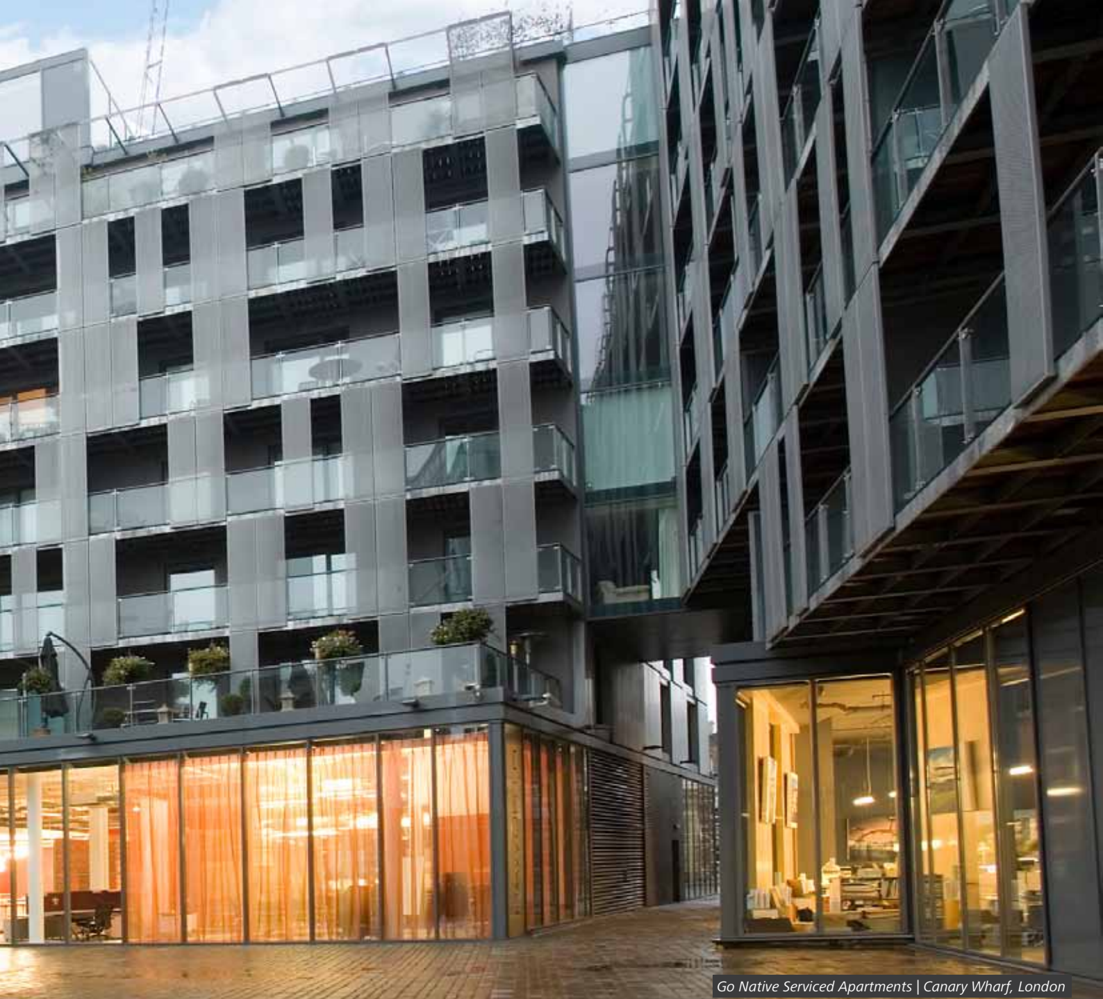
Go Native Serviced Apartments | Canary Wharf, London